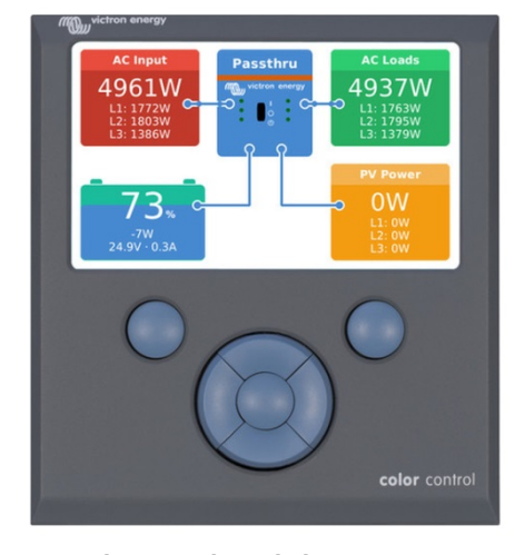
Color Control panel, showing a PV application

When connected to the Ethernet, systems with a Color Control panel can be accessed and settings can be changed.