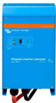
Phoenix Inverter Compact 24/1600

The possibilities of paralleled high power inverters are truly amazing. For ideas, examples and battery capacity calculations please refer to our book "Energy Unlimited" (available free of charge from Victron Energy and downloadable from www.victronenergy.com ).