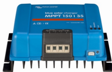
Solar charge controller MPPT 150/35