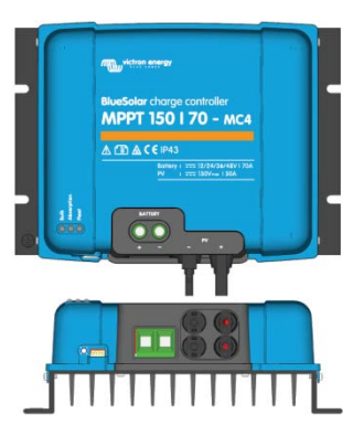
Solar charge controller MPPT 150/70-MC4