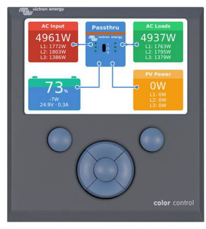
Color Control panel, showing a PV application

When connected to the Ethernet, systems with a Color Control panel can be accessed and settings can be changed.